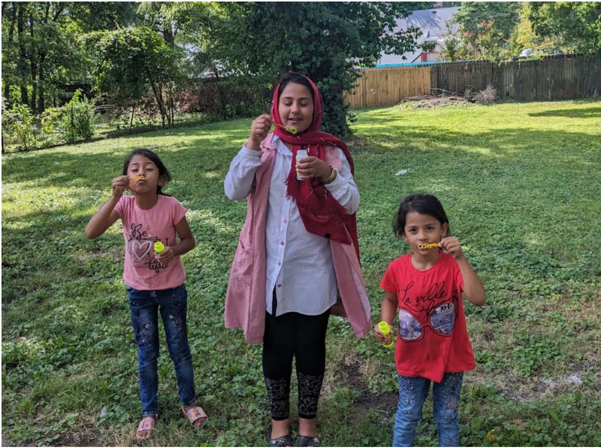
The daughters enjoying blowing bubbles in their backyard.